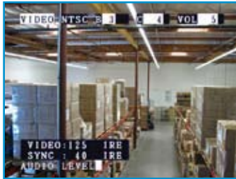
Video and sync level testing in IRE units (NTSC) or millivolts (PAL) and audio level testing with internal speaker and visible level scale. Available only in SecuriTEST PRO model.