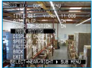
Access all on-board camera menus for easy programming