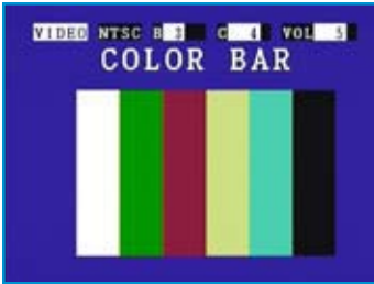
Test pattern generator outputs color bar and solid red, green, and blue screens in NTSC or PAL format