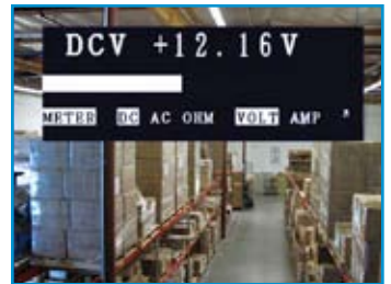
Full function digital multi-meter with large on-screen display tests AC/DC volts, AC/DC current, ohms and continuity. Auto and manual range selections