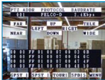
PTZ protocol analyzer can be used in-line to troubleshoot keyboard controllers and cameras