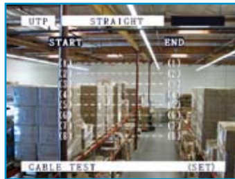
Wire map tester for UTP cabling with clear display of fault condition