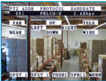
PTZ control with addressing for up to 255 cameras, 20+ protocols and 4 baud rates with selectable RS422/488 communications