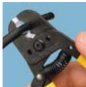
Omni SEAL Pro XL 30-793 – compresses BNC, F, and RCA compression connectors

The new IDEAL OmniSEAL™ compression tool now offers additional features and increased connector compatibility in a smaller, more compact tool designed to meet the demands of the professional installer.